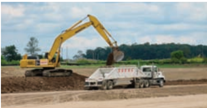
Nick Savko & Sons moved more than three million cubic yards of dirt in five months and completed the earthwork phase a month ahead of schedule.

project. The company purchased a Caterpillar D6N and equipped it with a Trimble GCS900 Grade Control System. The GCS900 is a 3D grade control system that puts the design grade surfaces and alignments at the operator's fingertips. The system uses GPS technology to position the blade in real time, which eliminates the need for manual staking and improves productivity.