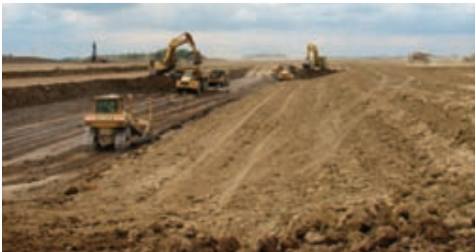
A Caterpillar D6N was equipped with a Trimble GCS900 Grade Control System with the GLONASS option for blade control within three to six millimeters.